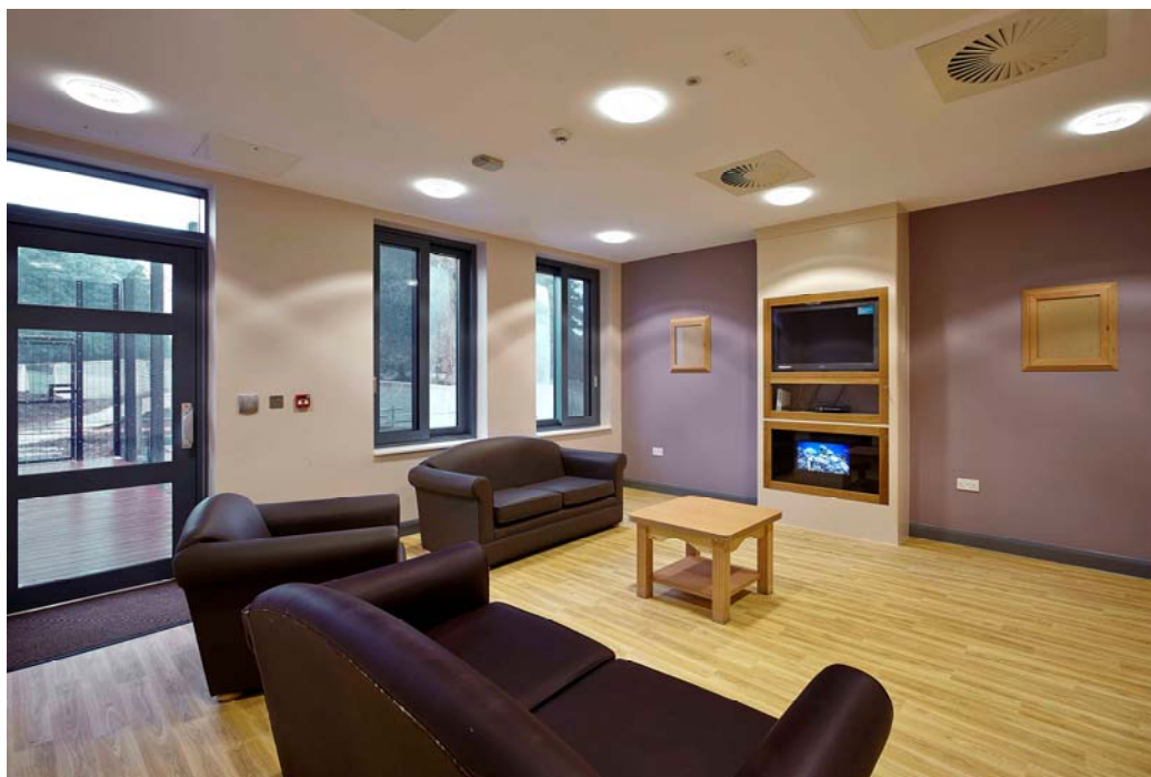
The lounge area in the male ward

During the project, the Trust has not received any complaints from clinicians working in the hospital about any disruption. There has been slight disruption to car parking on the Penn Hospital site which has resulted in both visitors and staff parking in neighbouring streets. Kier has not received any complaints regarding the construction work.